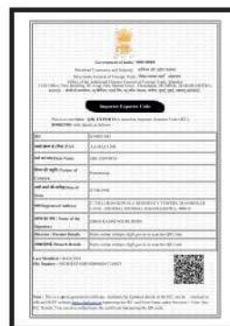
IEC Importer-Exporter Code