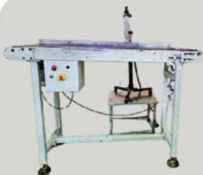
BATCH CODING MACHINE