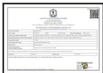
COCONUT DEVELOPMENT BOARD