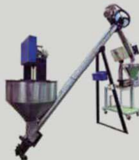
AUGER FILLER WITH SCREW CONVEYOR