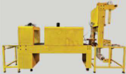
LD SHRINK WRAP