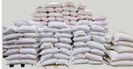
RAW MATERIAL RECEIVING AREA