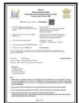
FSSAI Food Safety and Standards Authority of India