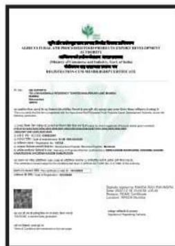
APEDA Agricultural & Processed Food Products Export Development Authority