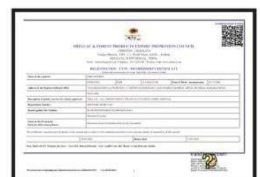
SHEFEXIL Shellec & Forest Products Export Promotion Council