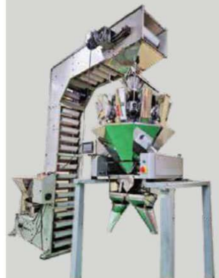
LINEAR MULTI HEAD PACKING MACHINE Z - CONVEYOR