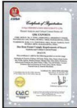
HACCP Hazardous Analysis and Critical Control Point