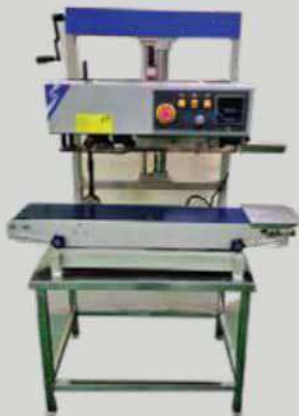
BAND SEALING MACHINE