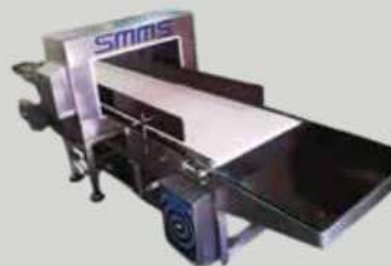
METAL DETECTOR MACHINE