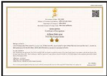
TWO STAR EXPORT HOUSE